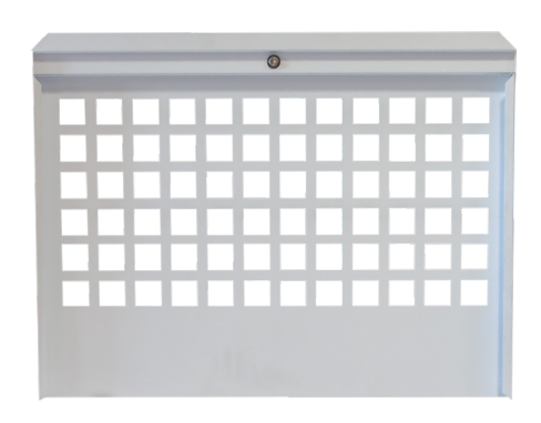
Lockable Security Cage

Saddle Bag Available for VM-7 (with 4 shelves), VM-12 (with 7 shelves), and VM-18 (with 7 shelves).