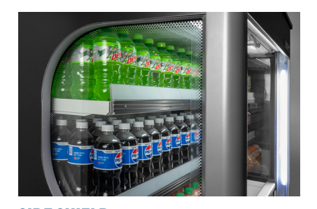
SIDE SHIELD to maximize product display